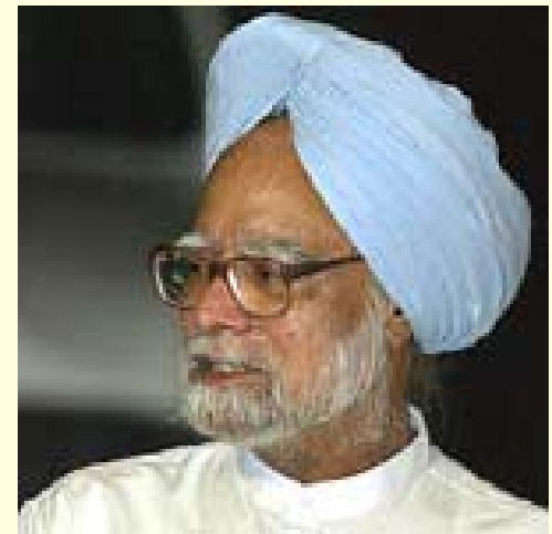
Congress PM Manmohan Singh