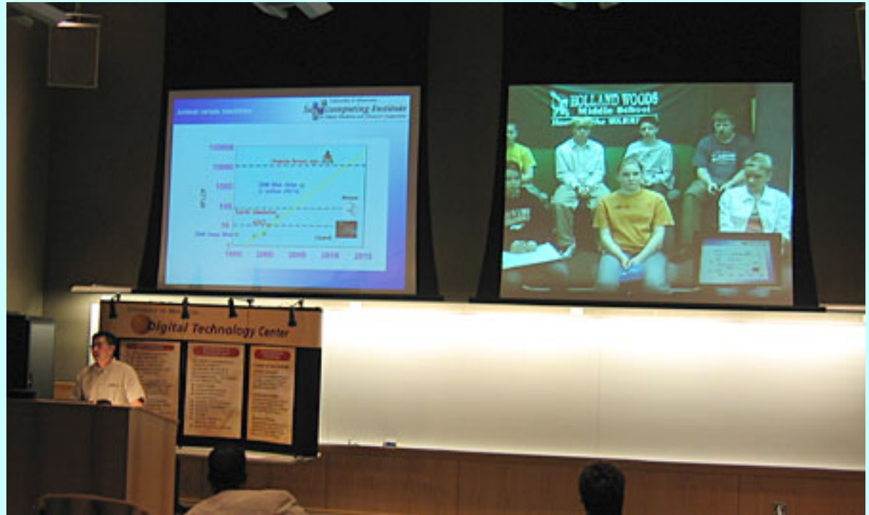
Users in action: A remote seminar “What is a supercomputer?” at University of Minnesota.