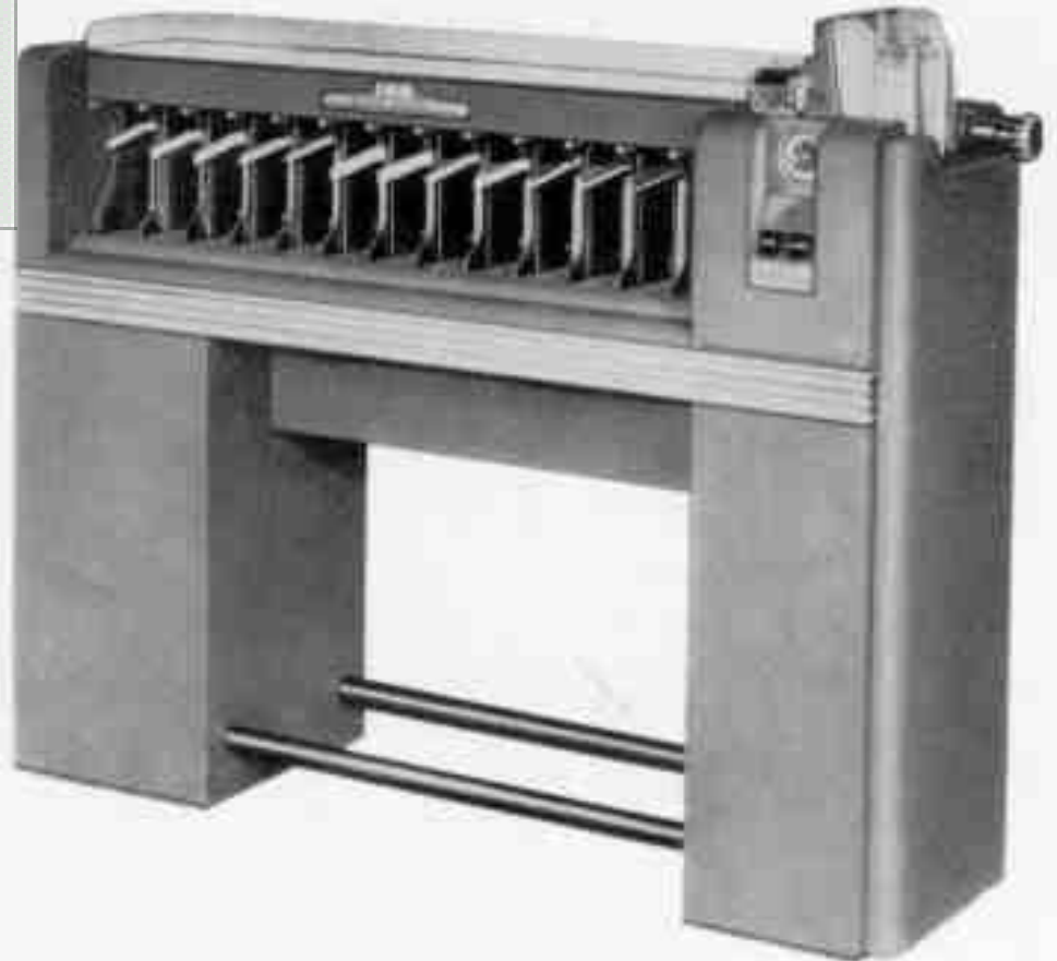
Type 82 Electric Punched Card Sorting Machine

Used an appropriate combo of mechanical, digital, and human effort to get the job done.