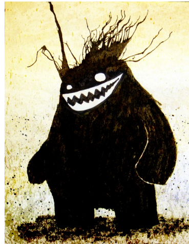
Figure 4.3: Concept art of an Ink Blob

The only other characters in the game world are the Bosses and Quasi-Bosses which exist inside the books. The bosses, or Ink Blobs, can best be described as mischievous . They are not quite evil, but are definitely up to no good. Please refer to the Game World Document for further information.