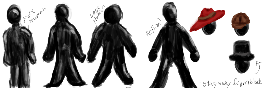
Figure 4.2: Concept art of the Magicien's Hero, featuring customizable Hats.

For detailed information, see Appendix ??.