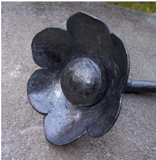
Figure 1: Water lily

In a previous article I gave an account of making a daisy. In this article you find an account of making a water lily. For the daisy, the bloom center was screwed to the stem, which is somewhat unsatisfying. I built the lily so as to experiment with further ways to attach a bloom to a stem.