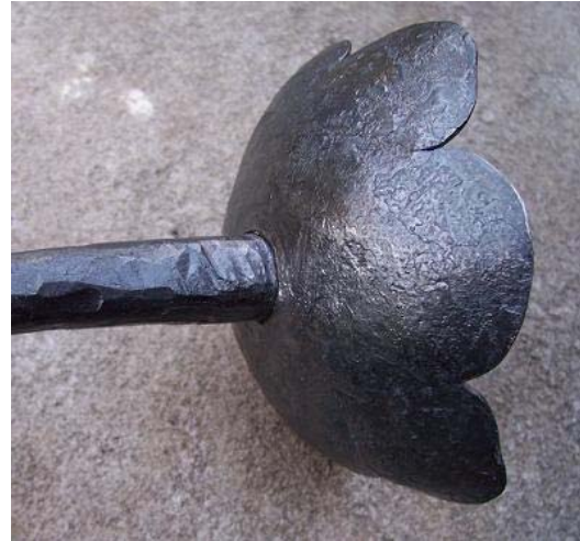
Figure 2: Back of lily

The center hole needs to be cut so that it fits the stem snugly. As a matter of fact, I drilled the hole before forging the bloom. When I formed the center cup, the hole was enlarged and a slight lip formed on the inside.