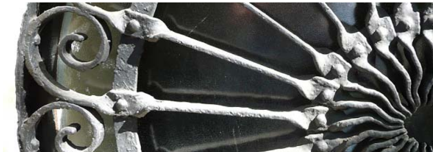
Figure 2: Detail

Consider the individual “rays” of the gate; each has a scroll on the outer end and a wave on the inner end. Each ray is riveted in three places: an inner and middle circle made from flat bar stock, and an outer ring made from angle iron. The rays have a 90 degree back and forth twist at the two places where they are riveted to the inner and middle circles. The scrolls are riveted to the outer ring but not to each other.