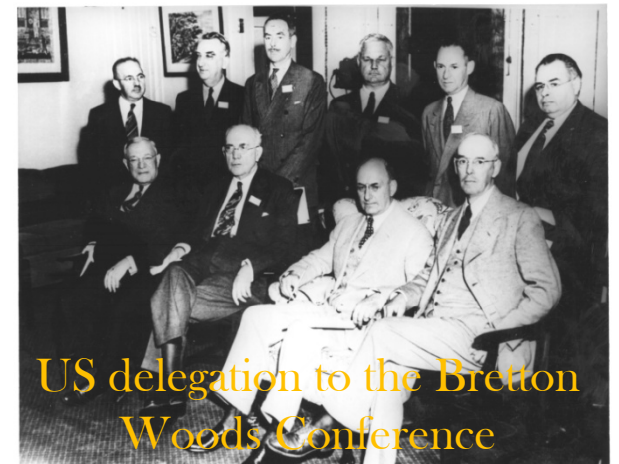
US delegation to the Bretton Woods Conference