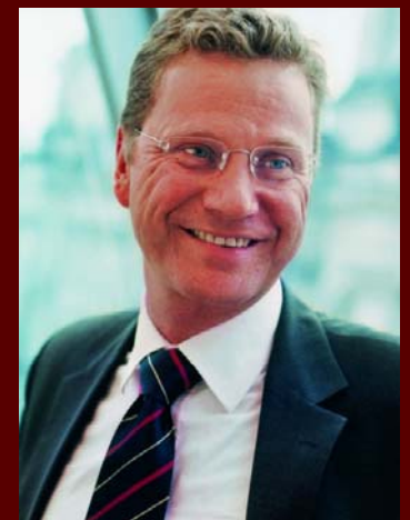
FDP Leader Guido Westerwelle