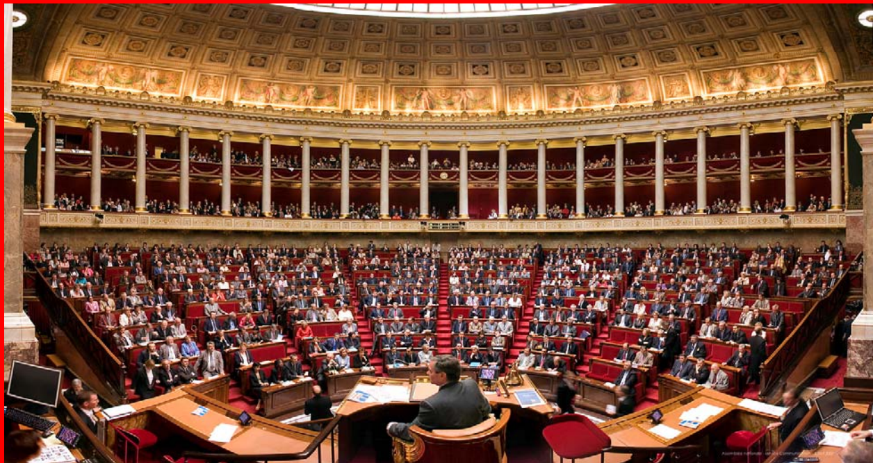
France's National Assembly