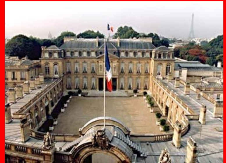
Elysee Palace President's Residence