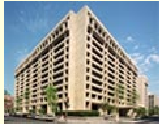
The heart of the global economy? IMF headquarters in Washington, DC