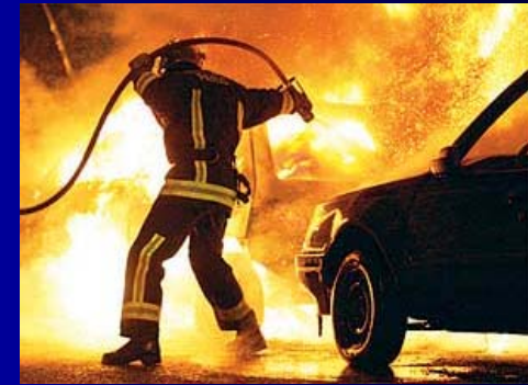
Parisian banlieues burn...