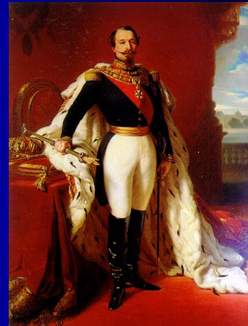
Emperor Napoleon III