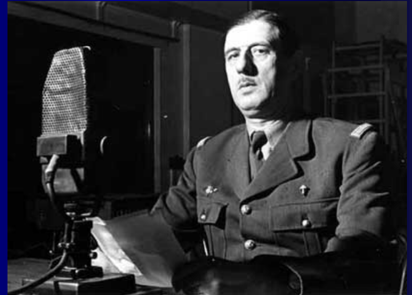
Gen. Charles de Gaulle urges resistance