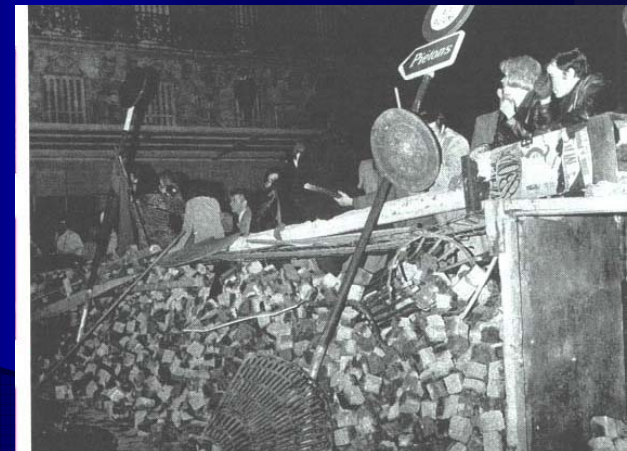
Students at the Barricades in Paris