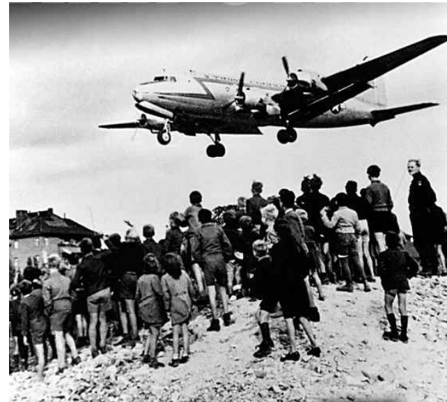
The Berlin Airlift