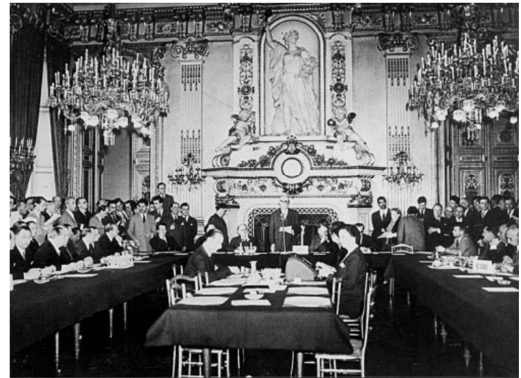
Announcing the Schuman Plan May 9, 1950