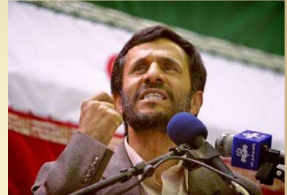
President Mahmoud Ahmadinejad