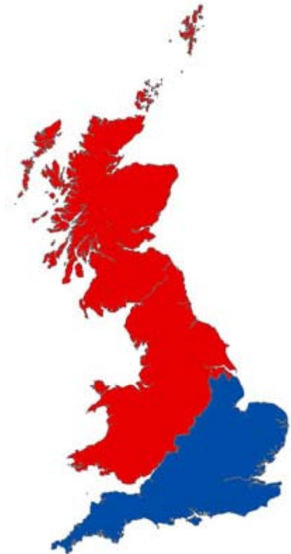
The 'North-South Divide'