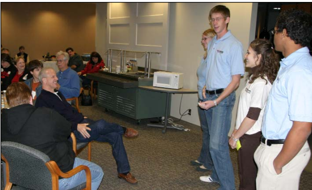
Learning About Leadership Academy: Students who have completed Rose-Hulman's Leadership Academy made a presentation during the Parents' Association's Dad's Day meeting. The parents will conduct special fundraising efforts throughout the school year to support the academy.