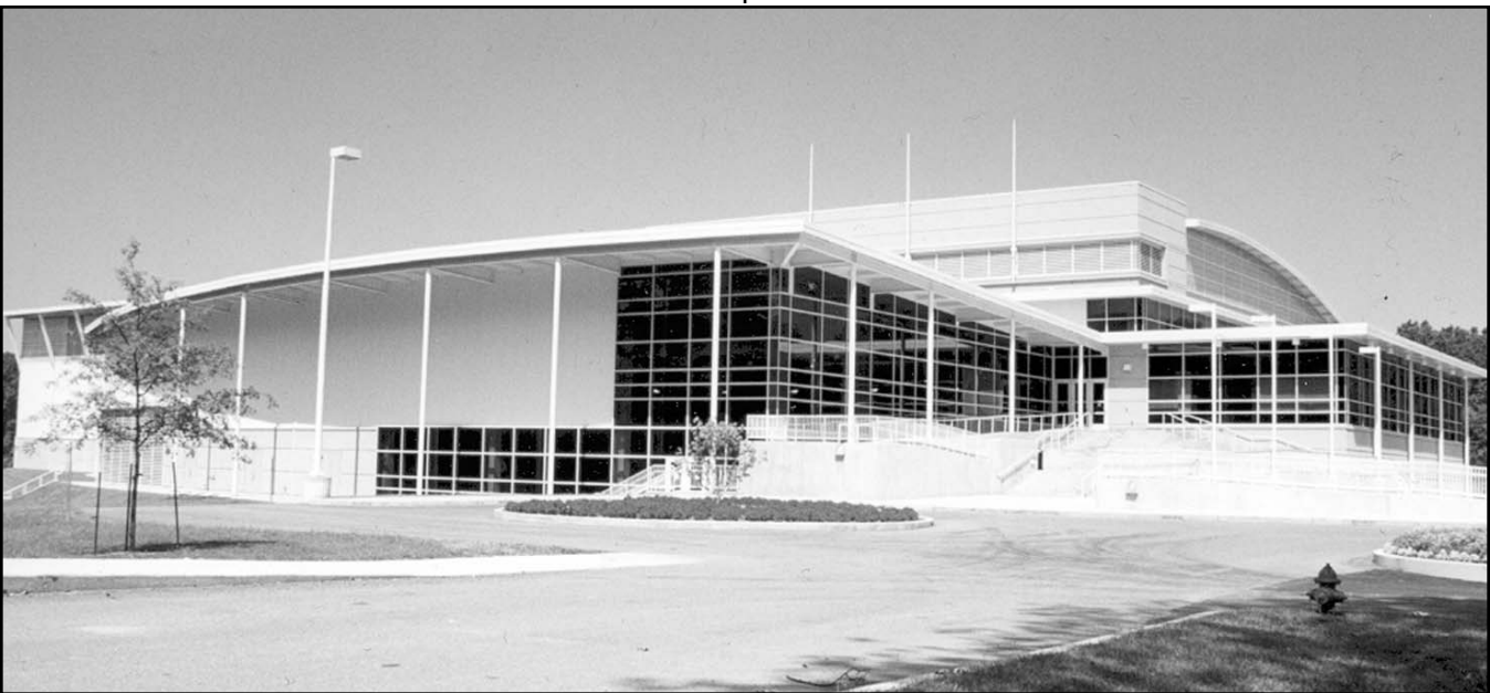
Sports and Recreation Center

The Rose-Hulman Softball Field is also a state-of-the-art facility. The Softball Field contains lights, an inning-by-inning scoreboard, and a press box featuring air conditioning and heating. The facility includes finished dugouts for both squads, double-circle bullpens that are located off the field of play, bleachers on both the first and third base side, a state-of-the-art field drainage system, and a storage shed for equipment behind home plate.