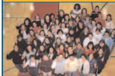
The first group of women students that went through Rose-Hulman in four years poses in Hulbert Arena for a group photo during May of 1999, just days prior to their graduation.