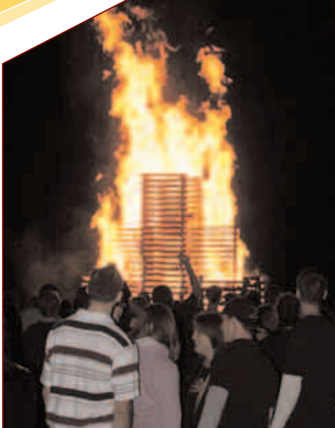
Freshmen continued the bonfire tradition in blazing fashion.