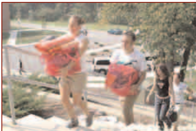
Move-in day for the 2005-06 academic year.