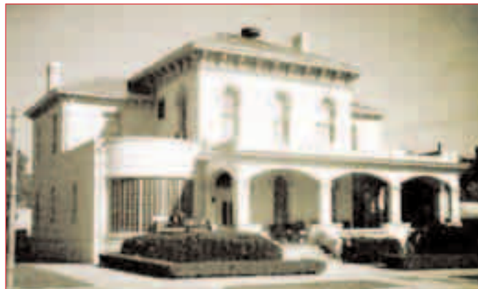
The first president's house as a funeral home in the late 1960s or early 1970s.

Six days later the subject had turned to dividing the stable for extra space. “By dividing off the southern end of it, spacious laundry can be made on the ground floor, with a room on the second floor for a man, if you should desire to keep one.” [July