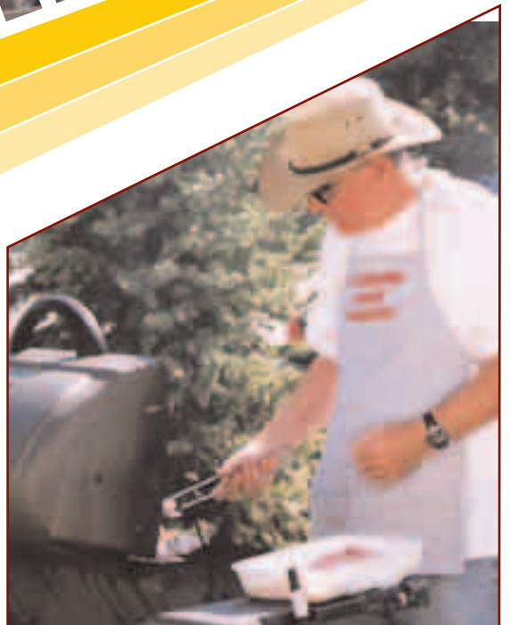
The Parents' Association fired up their famous pork chops.