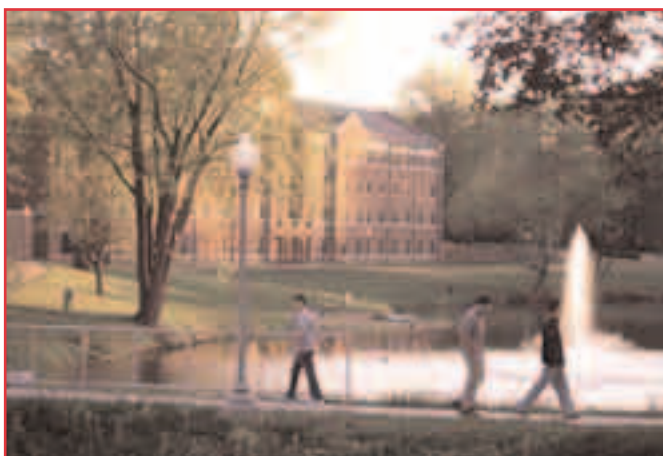
Percopo Hall stands along the edge of Rose-Hulman's large lake.

The Board is seeking candidates who appreciate, understand and are committed to the role and mission of an undergraduate college of engineering, science and mathematics, and they must have the capability to lead such an institution through the challenges facing engineering education in the 21st Century. This position requires impeccable integrity, exemplary interpersonal and communication skills, a high energy level, and a deep and abiding passion for educating students. Rose-Hulman is characterized by a strong sense of campus community, and the President will set the example for the Institute in ethics, morals, integrity and community involvement.