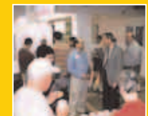
Academic open houses