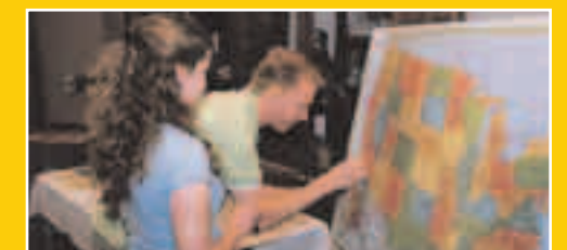
Alumni check in at the Alumni Center.