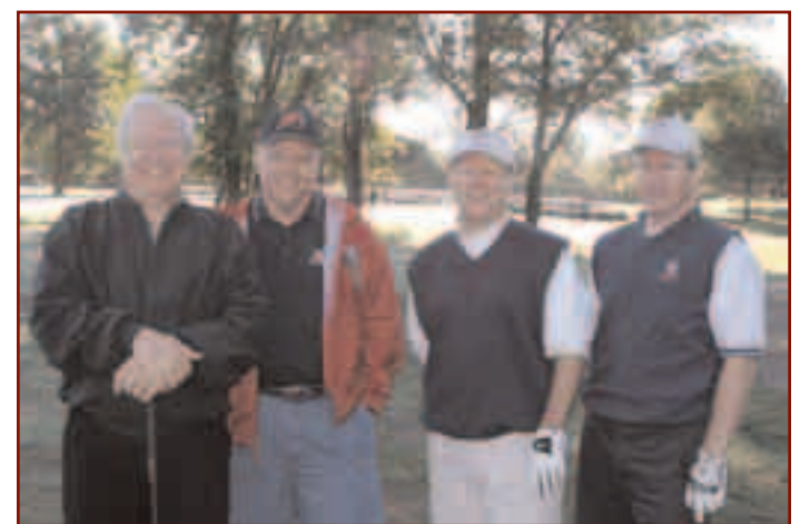
Foursomes filled Friday's golf outings.