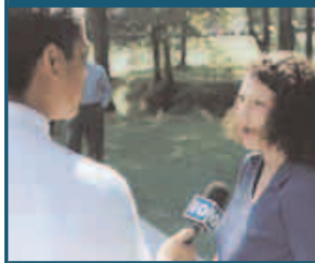
Media attention was heavy during the first day of class as television stations interviewed both women and men students on campus.

"The best advice we got was to treat the female students just like any other students, because, in reality, they were," she admits. "We must have done something right, because I don't remember any significant problems."