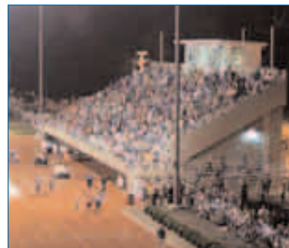
A night practice draws more than 6,000 to Cook Stadium.

The Indianapolis Colts training camp at Rose-Hulman Institute of Technology attracted a camp record 20,131 fans over a three-week period in July and August.