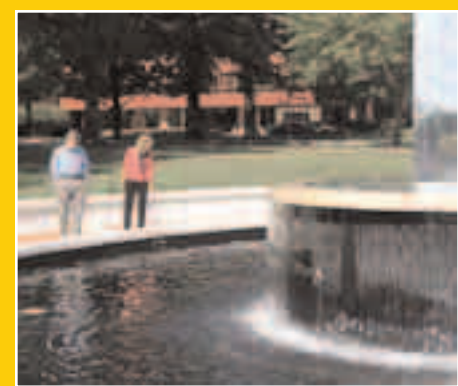
Reviewing bricks of honor at Reflection plaza