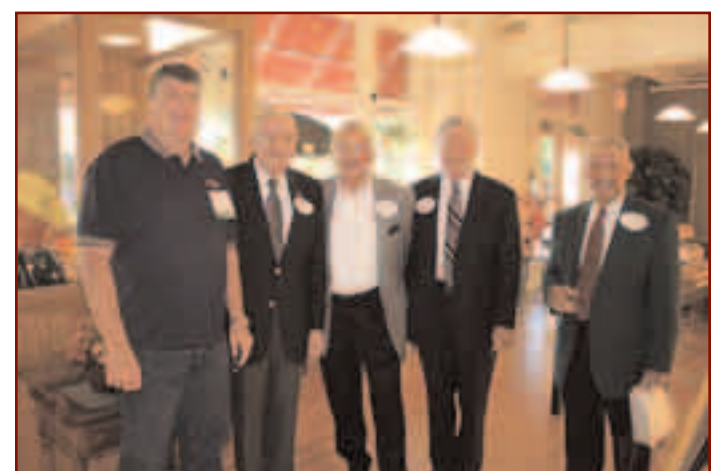
Alumni parties in Terre Haute drew attendees from various eras.