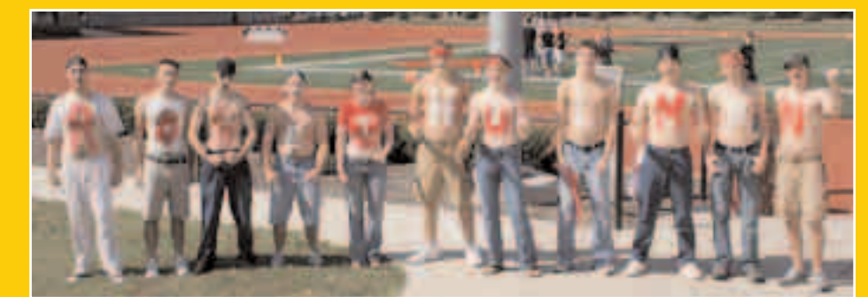
Engineer fans have fun with phonics at the football game.