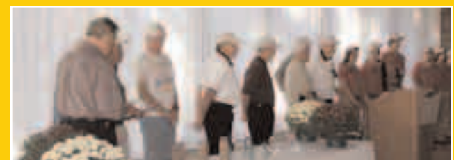
The class of 1955 and the Student Alumni Association team up for a rendition of Dear Old Rose.