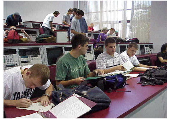
ECE Studio Laboratory, Located in B105