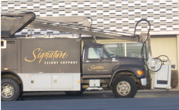
Figure 3: Open Basket

Deicing vehicles are commonly used at airports to surround airplanes and spray them with deicing fluid. By making the baskets on these vehicles enclosed, the overall use of deicing fluid can be reduced. An example of a deicing vehicle with an open basket is shown in Figure 3, while an enclosed-basket deicing vehicle can be seen in Figure 4.