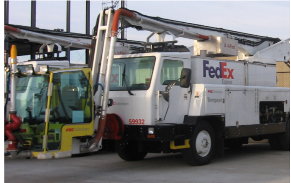
Figure 4: Enclosed Basket

As is visible in Figure 4, the enclosed-basket allows the operator to be free from the elements. While deicing, the operator does not have to worry about fluid rebounding off the aircraft back at them, which allows them to get closer to the aircraft and more efficiently deice. Furthermore, since deicing usually occurs on cold days, the operator can perform their duties in a confined heated area, so the overall performance will improve. Some airlines have reported a total deicing fluid reduction of 30% by making use of enclosed-basket deicing vehicles (EPA, 2000).