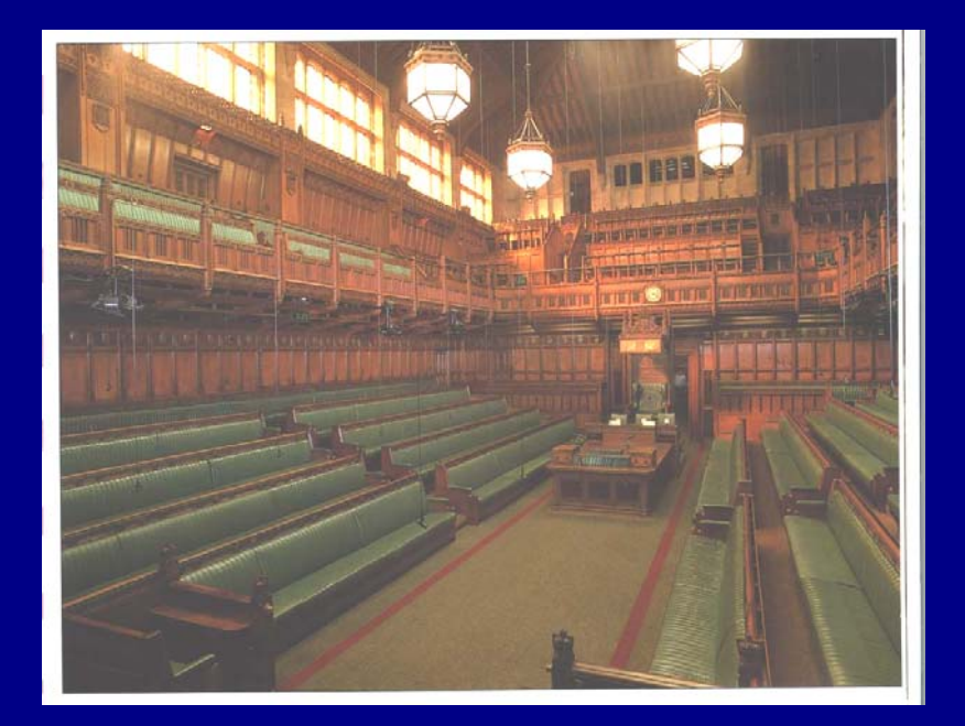
Chamber of the House of Commons