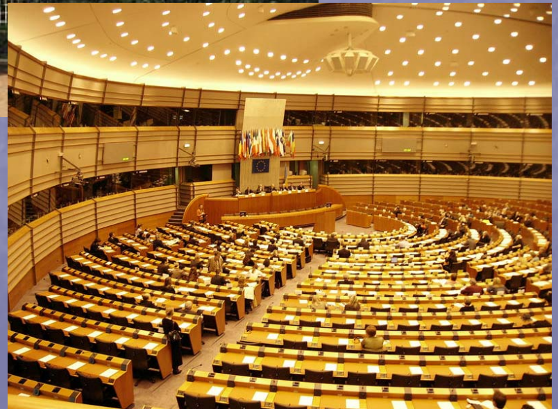
The European Parliament Building and Chamber in Brussels, Belgium