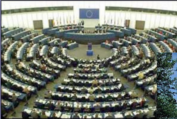
The European Parliament Building and Chamber in Strasbourg, France