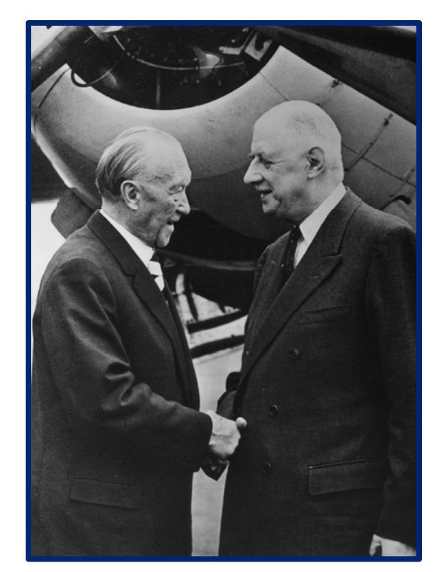
Konrad Adenauer and Charles de Gaulle