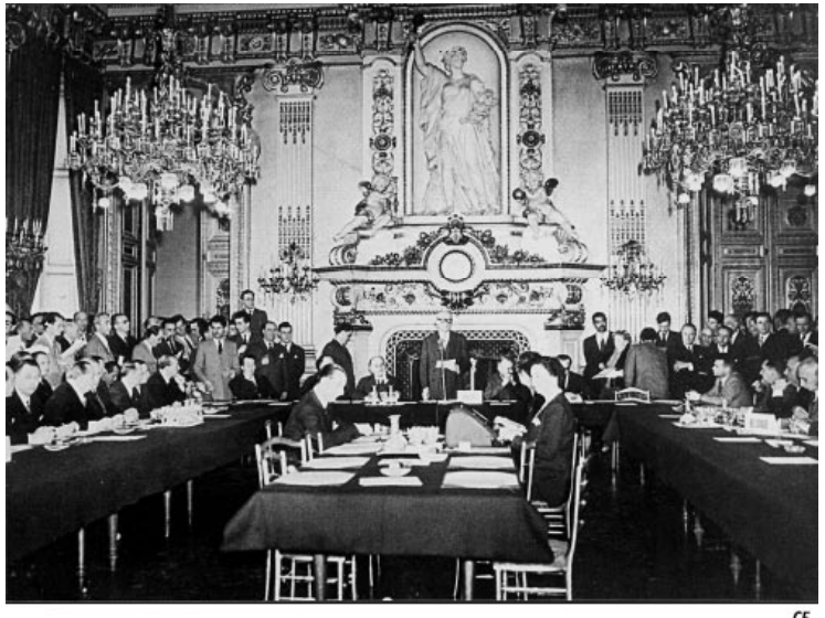
Announcing the Schuman Plan May 9, 1950