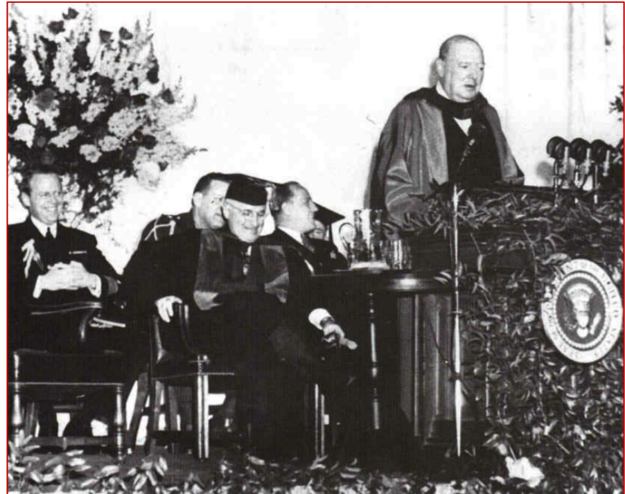
Churchill's 'Iron Curtain' Speech at Westminster College, Fulton, MO (President Truman in the funny hat)