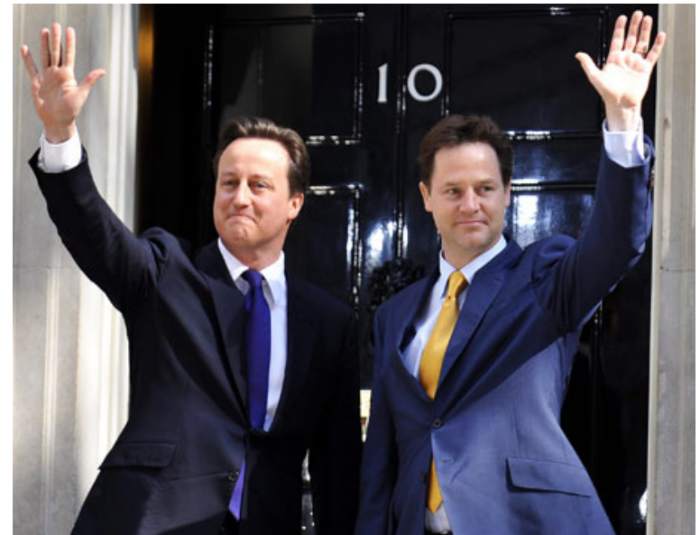
Prime Minister David Cameron and Deputy Prime Minister Nick Clegg