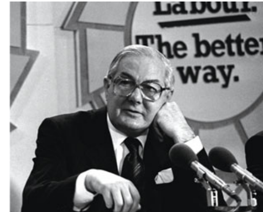
“Sunny Jim” Callaghan cheers no one...