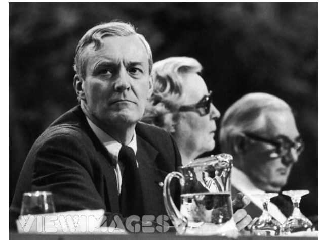
...Tony Benn looks for a different way.