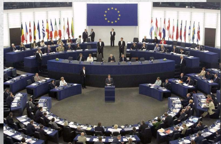
The European Parliament