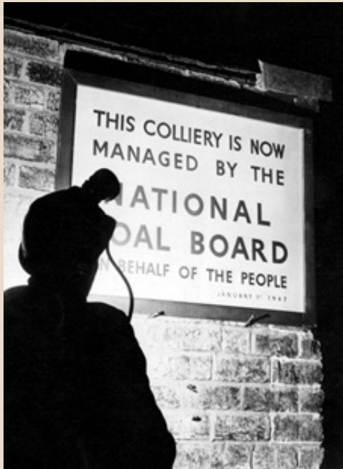
A sign of the times.